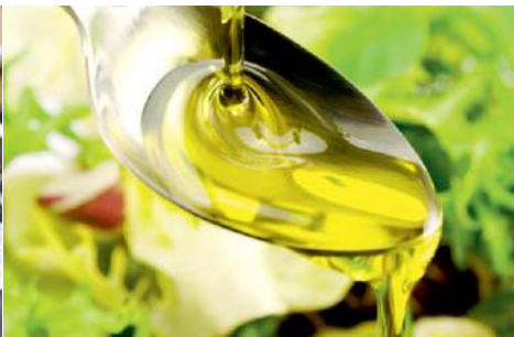
Oil, Fats & Food