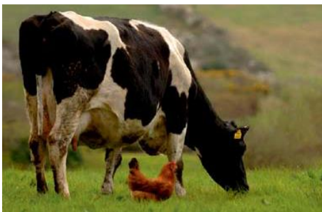
Animal Feed & Nutrition