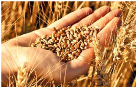
Agricultural Commodity Trading & Processing