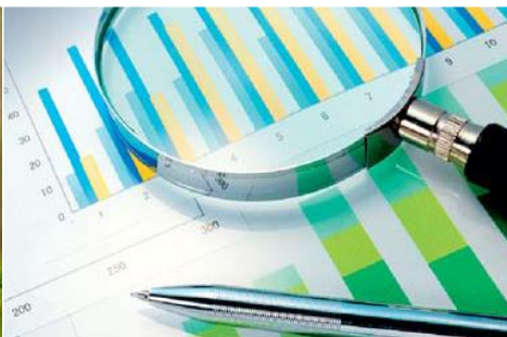
Financial & Risk Management