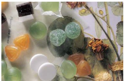
Starches & Sweeteners