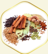
Spices & Seasoning