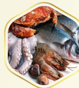
Fish & Fish Products