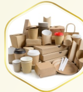
Food Packaging Material