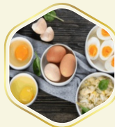
Eggs & Eggs Products