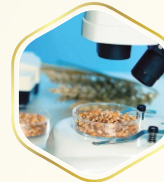
Food Testing Laboratories