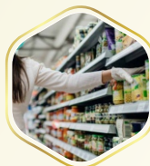
Retail & Wholesale