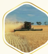
Innovation in Food Safety System & Practices