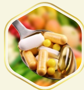
Health Supplements & Nutraceuticals