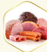
Meat & Meat Products