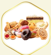
Bakery & Bakery wares