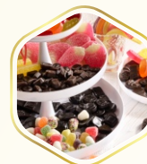
Flavors & Like Products