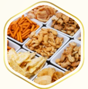
Snacks & Savouries