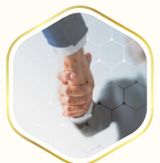
Joint Application: Partnership Development