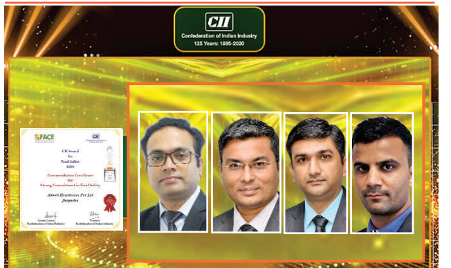
Abbott Healthcare Pvt Ltd, Bharuch - Large