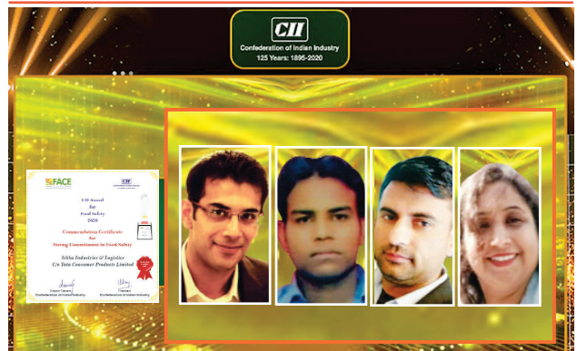
Sikka Industries & Logistics C/o Tata Consumer Products Limited, Small and Medium