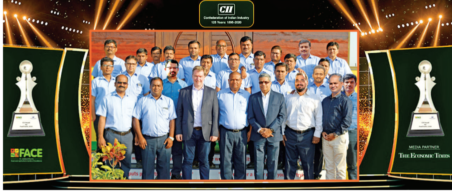
Pernod Ricard India(P) Limited, Nashik - Large