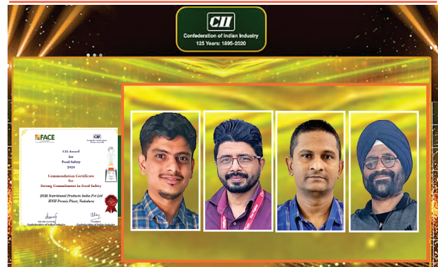
DSM Nutritional Products India Pvt Ltd, HNH Premix Plant, Vadodra - Large