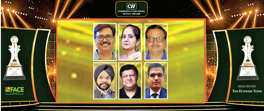
PepsiCo India Holdings Private Limited (Fritolay Division), Sangrur, Punjab - Large