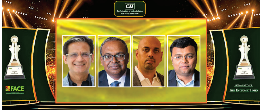
Amway India Enterprises Pvt Ltd, Tamil Nadu - Large