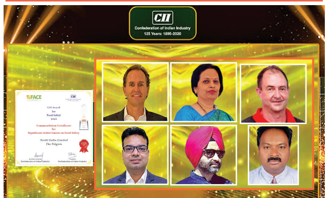
Nestle India Limited, Nilgiris, Large