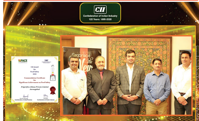
Frigorifico Allana Private Limited, Aurangabad - Large