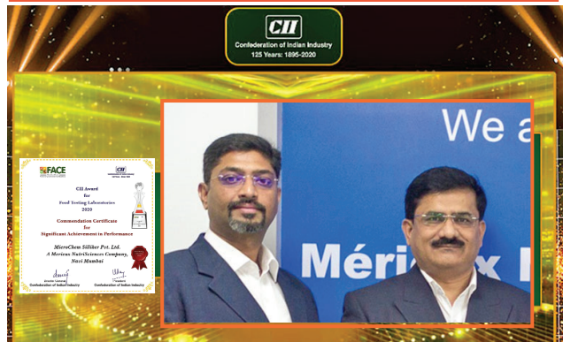
MicroChem Siliker Pvt. Ltd., A Merieux NutriSciences Company, Navi Mumbai - Large