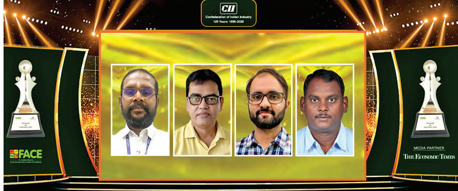
ITC Limited, FBD, ICML, Pudukkottai, Atta Unit - Large Rising Star