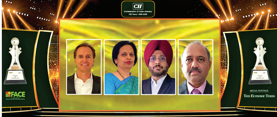
Nestle India Limited, Ponda - Large