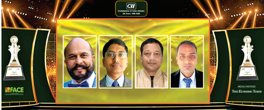
Damdin Packaging Centre, Tata Consumer Products Ltd - Small & Medium Rising Star