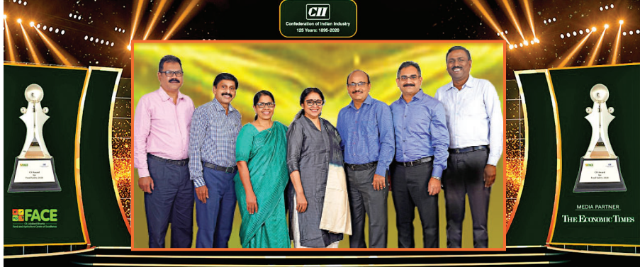
AVT McCormick Ingredients Pvt Ltd, Ernakulam - Large