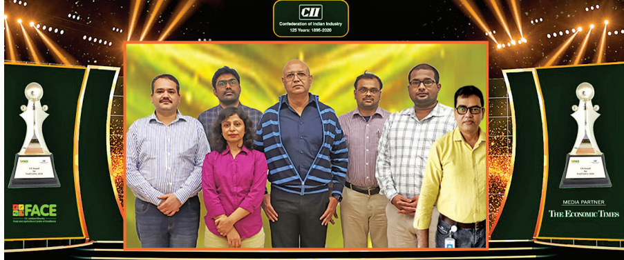
Integrated Consumer Goods Manufacturing Facility, ITC Ltd, Panchla - Large Rising Star