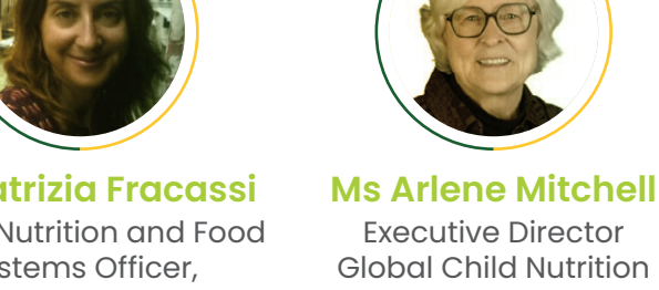
Global Child Nutrition Foundation Food and Nutrition