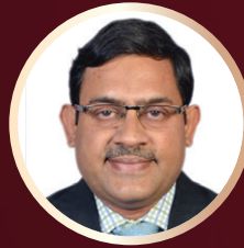
Jury Co-Chair & Pre-Jury Chair